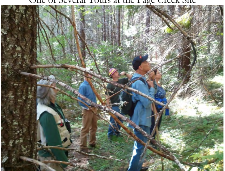
Figure Three One of Several Tours at the Page Creek Site

Residents expressed the following assortment of issues regarding the management of the Page Creek area: