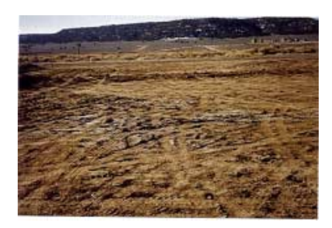
Photo A-11: Unidentified chemical residue from unauthorized dump site.