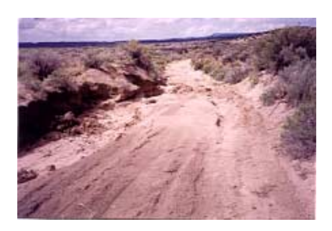
Photo A-5: Old pipeline corridor not re-seeded and experiencing erosion.