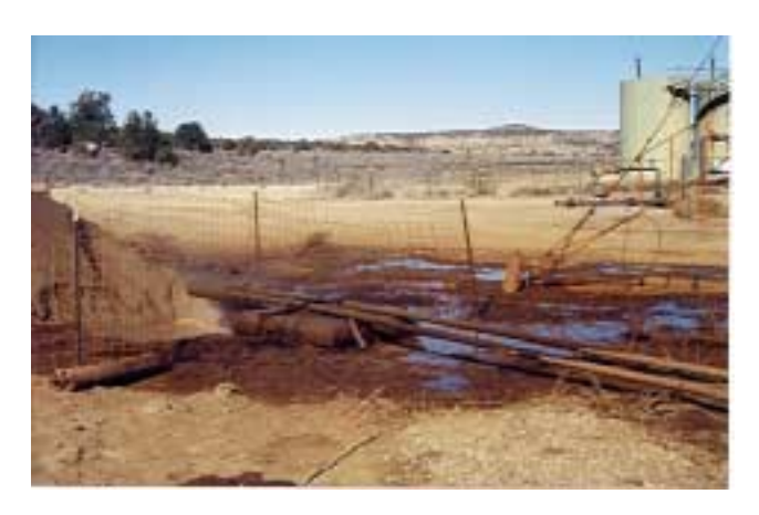
Photo A-13: An active 'open pit' for the storage of liquid waste, along with leaks on the ground.