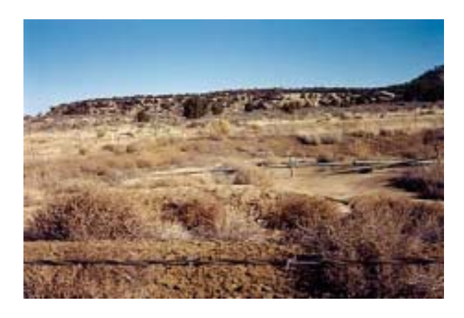
Photo A-14: An unreclaimed open pit used for storing liquid. The fences around them are often disturbed and open to intrusion.