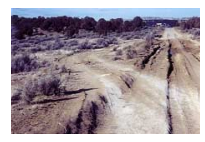
Photo A-6: Most roads are ungraveled, muddy and impassable sometimes, creating "make your own road" conditions.