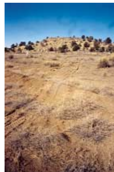
Photo A-8: Unauthorized road creation, stemming from gas site road, probably created by gas field workers, hunters, or other recreationists.