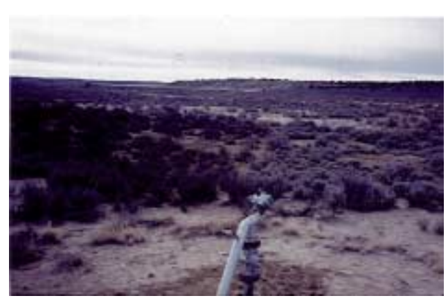
Photo A-2: "Dog leg" on a water well that blew and kept leaking. Note the oil soaked sagebrush.